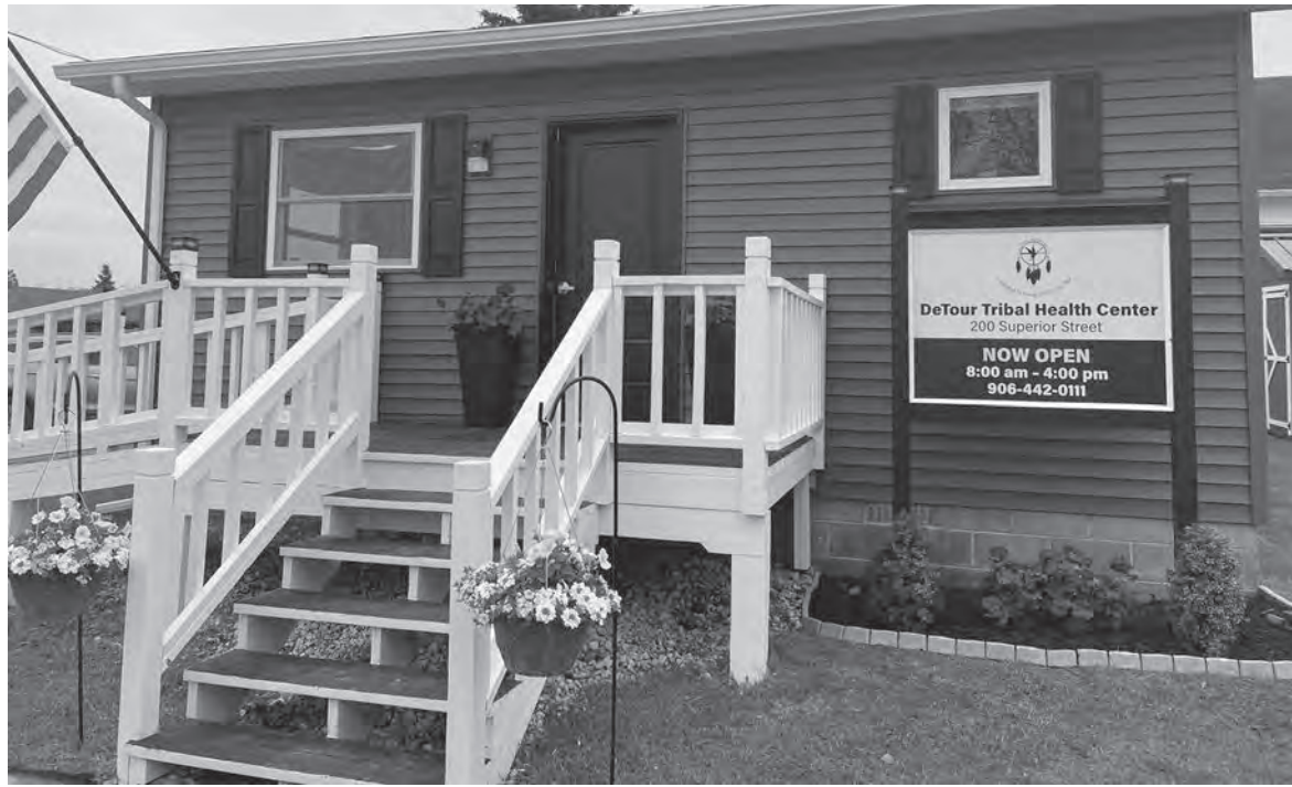
DeTour Tribal Health Center is located at 200 Superior St. in downtown DeTour.