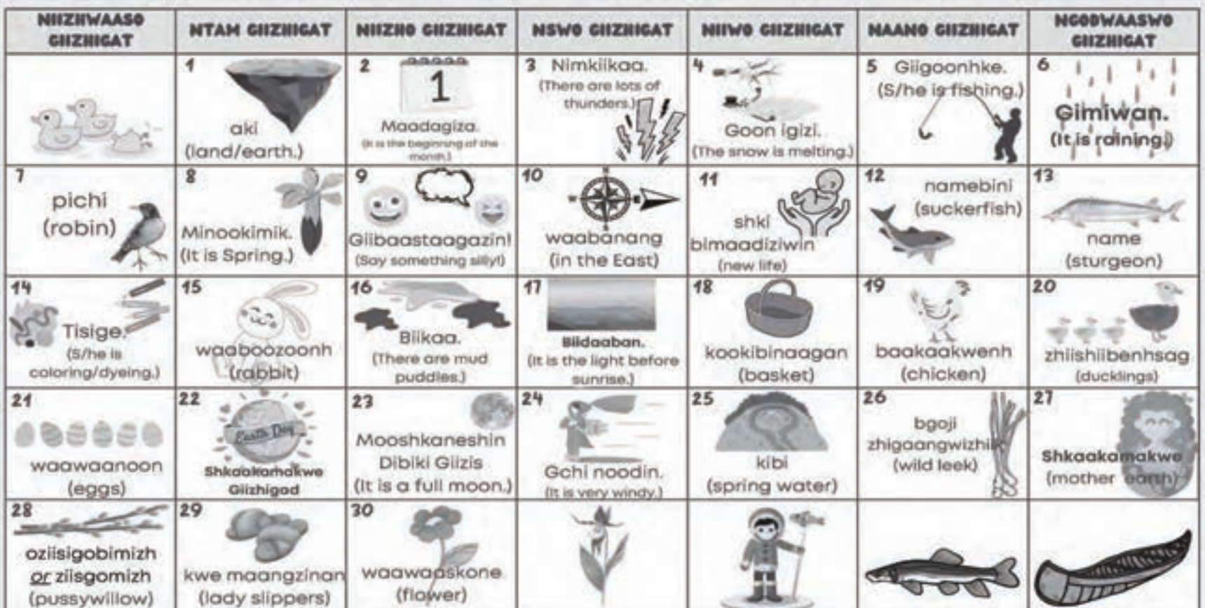
Calendar created by Sault Tribe Language & Culture Division